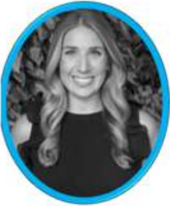
TAYLOR ALPHIN Deputy Ambassador