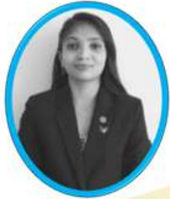
DIPALI TIKONE Deputy Ambassador