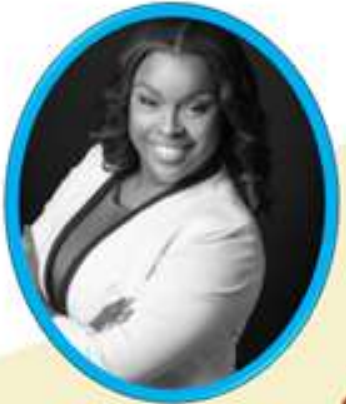
ROBYN CURTIS Deputy Ambassador