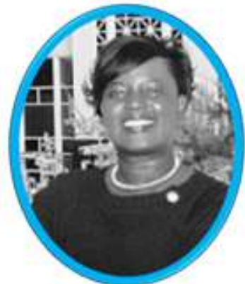
CLENISE PLATT Deputy Ambassador